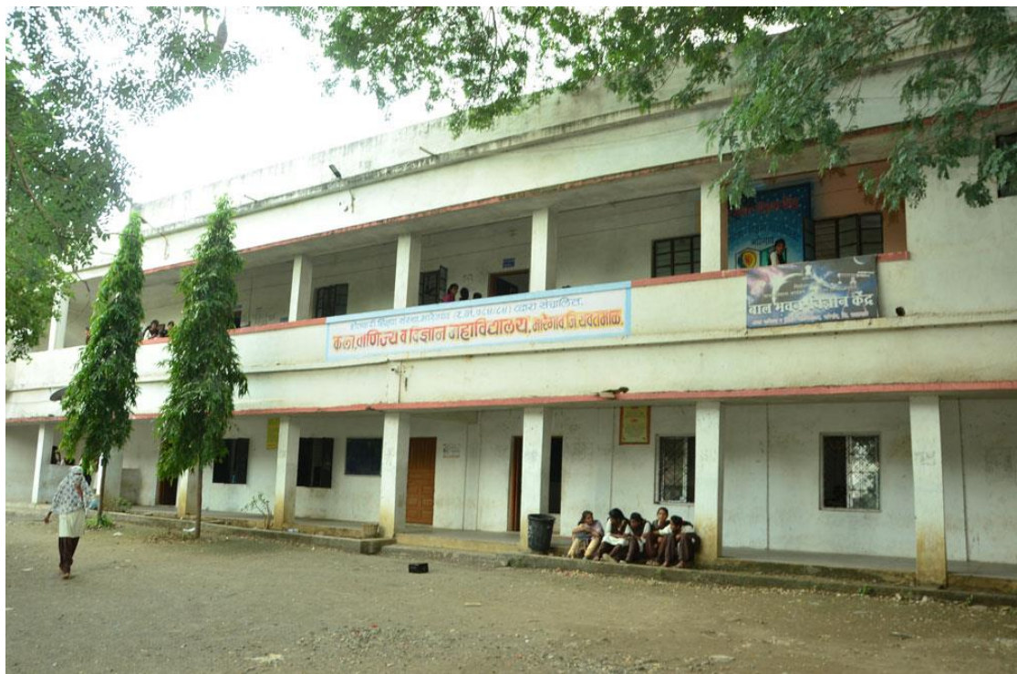
College Building (Section: Arts and Commerce)