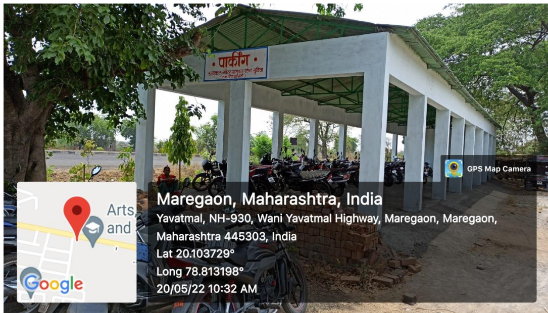
Parking for students