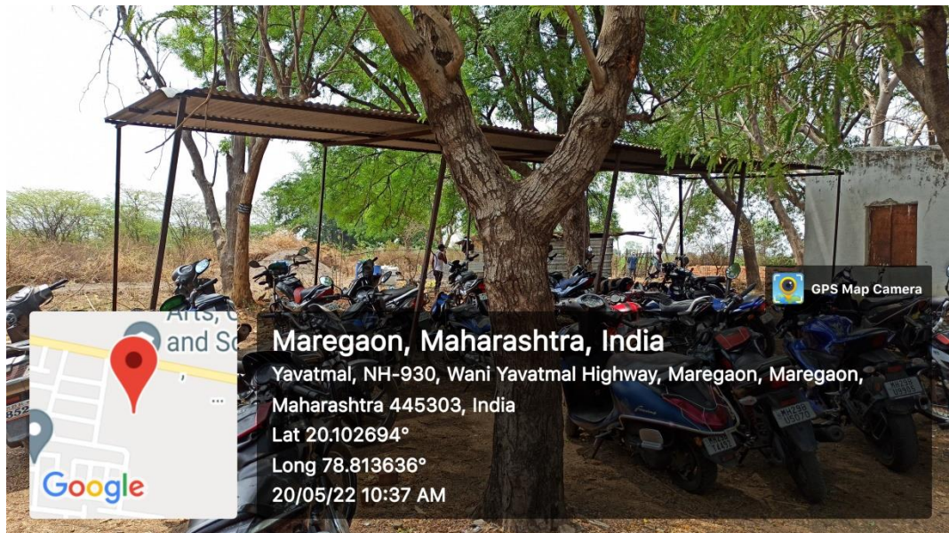
Parking for staff