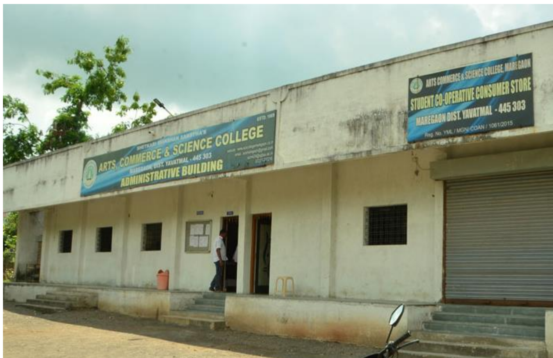
Administrative Building and Students co-operative consumer store