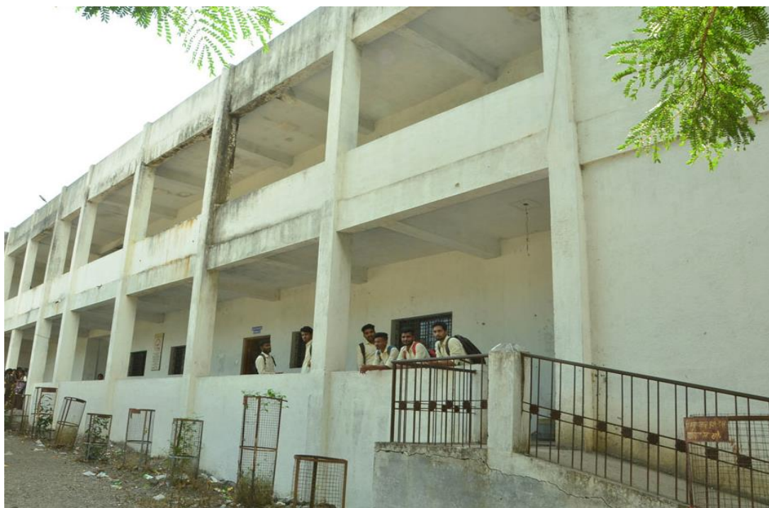
College Building (Section: Science)

The college has adequate infrastructural facilities as a catalyst for ensuring academic excellence. It has long term planning for expansion of facilities to meet future development. The Management takes keen interest and efforts to create and enhance the physical facilities to provide quality education. In every academic year proposals are invited from the departments that are then placed before CDC. The committee gives approval after identifying the needs based on the priorities for the development of infrastructure. The budget requirements are analyzed and sanctioned by the Management. The feedback of the stakeholders regarding their needs is also taken into consideration while deciding the policy. As per their suggestions and needs, the infrastructure is created and enhanced.